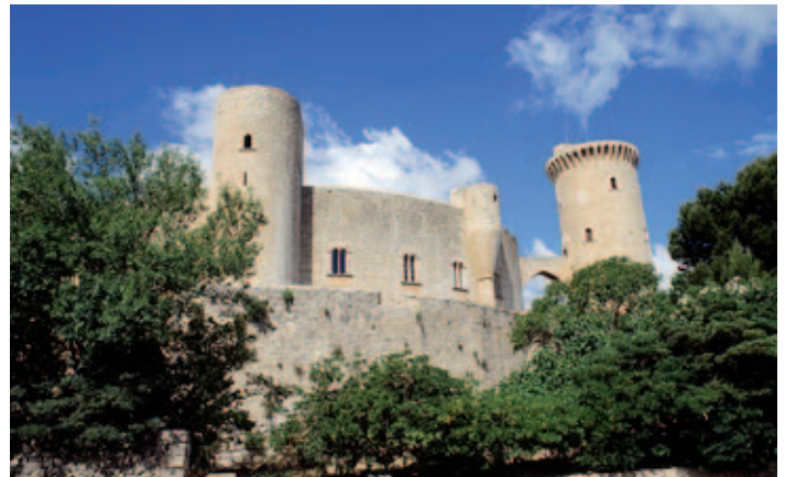
Bellver Castle.

Currently there are 2.2 million square metres of green areas in the city, including basically Bellver Castle, the Parc de sa Riera, the Parc de la Mar, the Ses Estacions park and the Parc Krekovic. In the future this figure is due to increase to 4.6 million square metres.