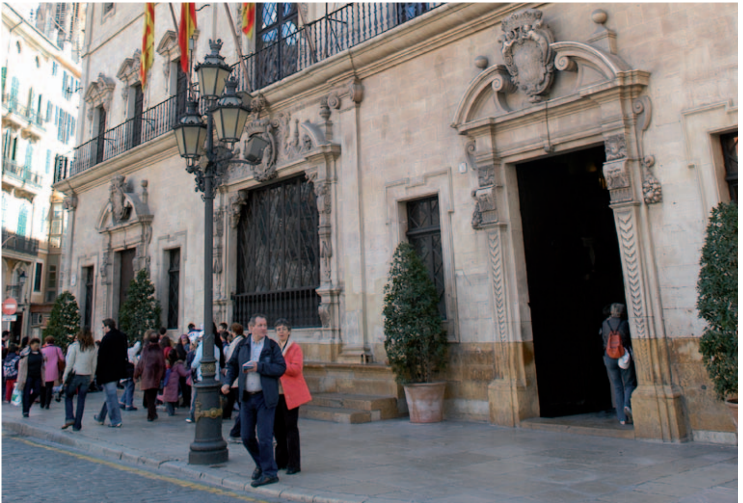
Palma City Hall.