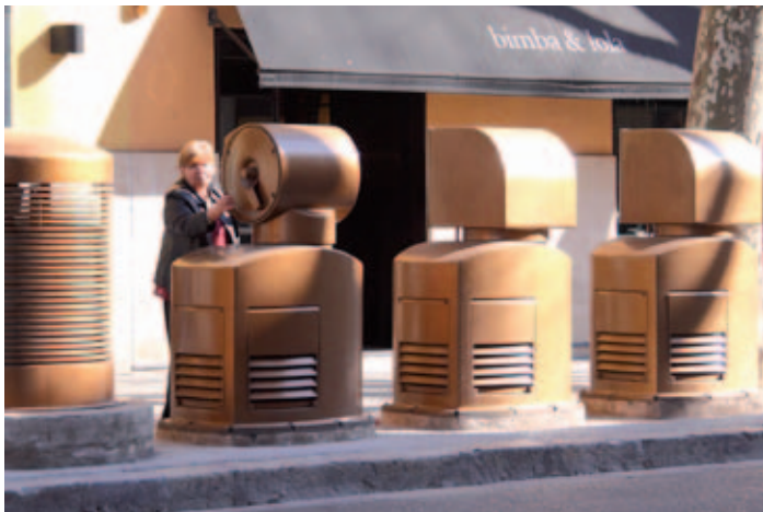
Pneumatic waste collection.

With the aim of offering a more streamlined and convenient waste collection service for citizens and shopkeepers in certain areas and in the more singular districts of the city, the Pneumatic Waste Collection system has been introduced. This system transports the waste from the pillar boxes installed on the public road to a Collection Centre, by means of a network of underground tubes. Once in the centre they are placed in large containers for subsequent transportation to the Treatment Centre. Pneumatic Waste Collection functions successfully in the centre of Palma, and as a result around 24,600 citizens benefit from this modern system.