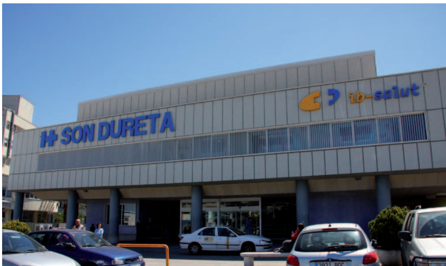
Son Dureta Hospital.

http://www.caib.es/sacmicrofront/contenido.do?idsite=145&cont=3184 (air quality data).