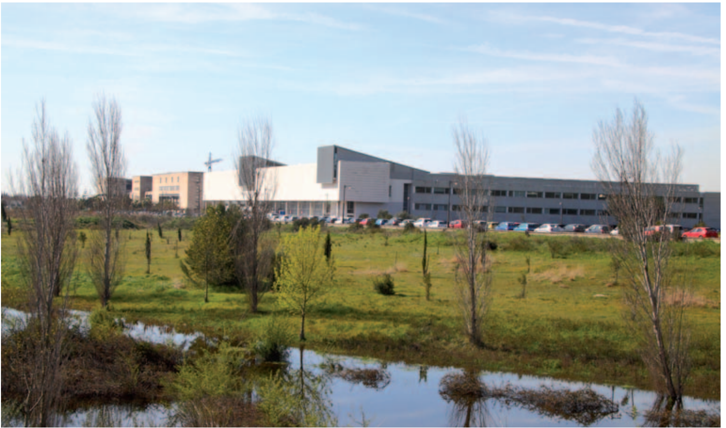
University of the Balearic Islands.