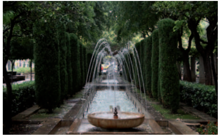
Hort del Rei.

Large gardens, squares with fountains, green areas, cycling lanes, children’s playgrounds and rest areas all make up the green scenery of Palma. The most visited green areas are Bellver Castle, the Parc de la Mar, the gardens of S’Hort del Rei, the garden of the Misericordia, the Parc de sa Riera, the Parc de Sa Feixina and the Ses Estacions park.