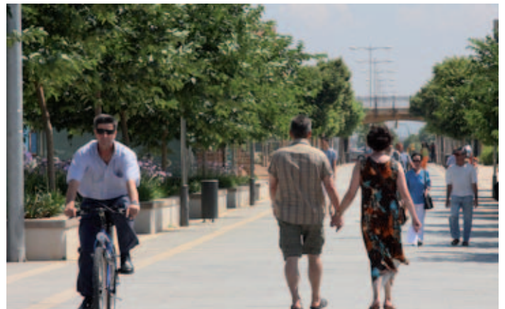
Ses Estacions Park.